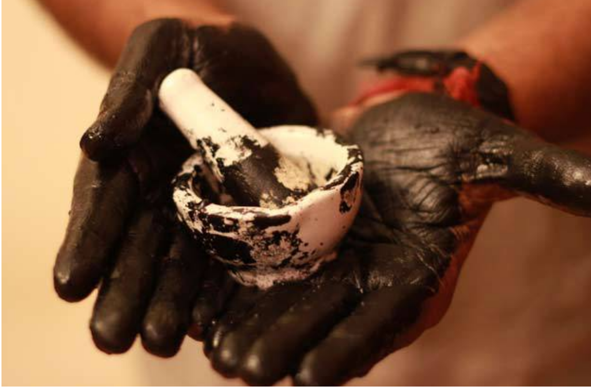
The Graviky Labs team getting their hands messy Graviky Labs.

"We thought what if we could use it as a pigment for colouring? We tied up with several designers, artists, chemists, and automobile experts to make this a reality. Since then, we have made a significant effort to car pollution. In the future, the 'art | bring this concept to reality," he told