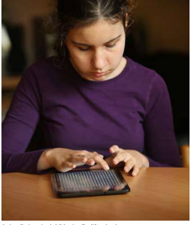
A visually-impaired child using Feelif technology.

The application makes it easier for the blind and visu-