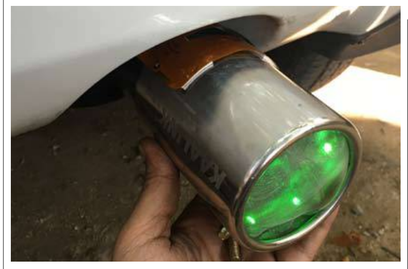
The contraption that captures car pollutions.