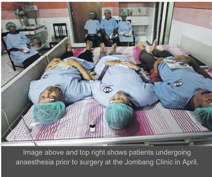
Image above and top right shows patients undergoing anaesthesia prior to surgery at the Jombang Clinic in April.