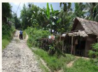
The road in Mandrehe, on the way to Gulo's home.